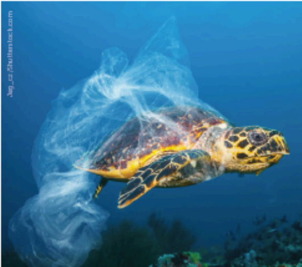
Garbage that washes into the sea can entangle marine animals.