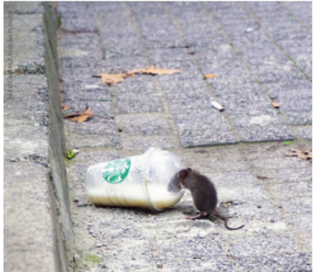
Litter attracts pest animals, such as mice, flies and cockroaches.

Litter is a major cause of pollution. Abandoned rubbish eventually blows or washes into gutters and drains. It then ends up in a waterway such as a creek, stream, river or ocean, where it makes the water dirty or polluted. Animals and plants that live in the water then become sick. Sometimes, animals might even die when they get trapped in litter in the water. People and animals should not swim in or drink dirty water. Making sure rubbish goes in the right place helps keep the water clean for people, plants and animals.