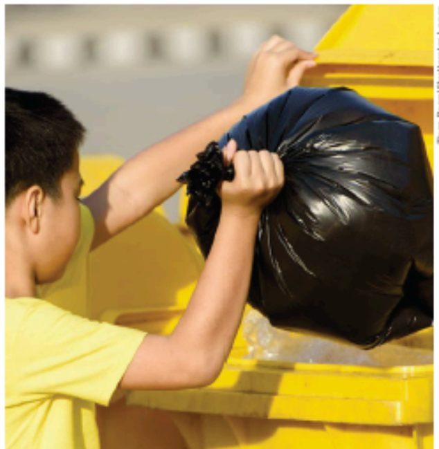
Putting trash in the right bin helps us save resources and care for our planet.

Litter can cause resources to run out, can pollute water, and can spread illnesses. It is a huge problem! Fortunately, it is a problem we can fix. The whole planet will be a cleaner, healthier place if everyone puts their rubbish in the bin!